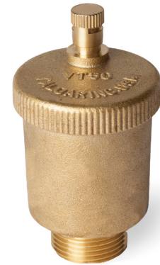
VT50 3/8" - 1"